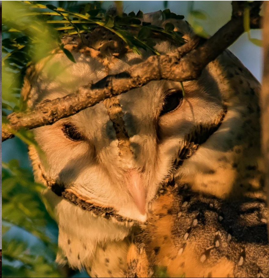
Top Left; Vereauxs Owl | Top Right; Barn Owl