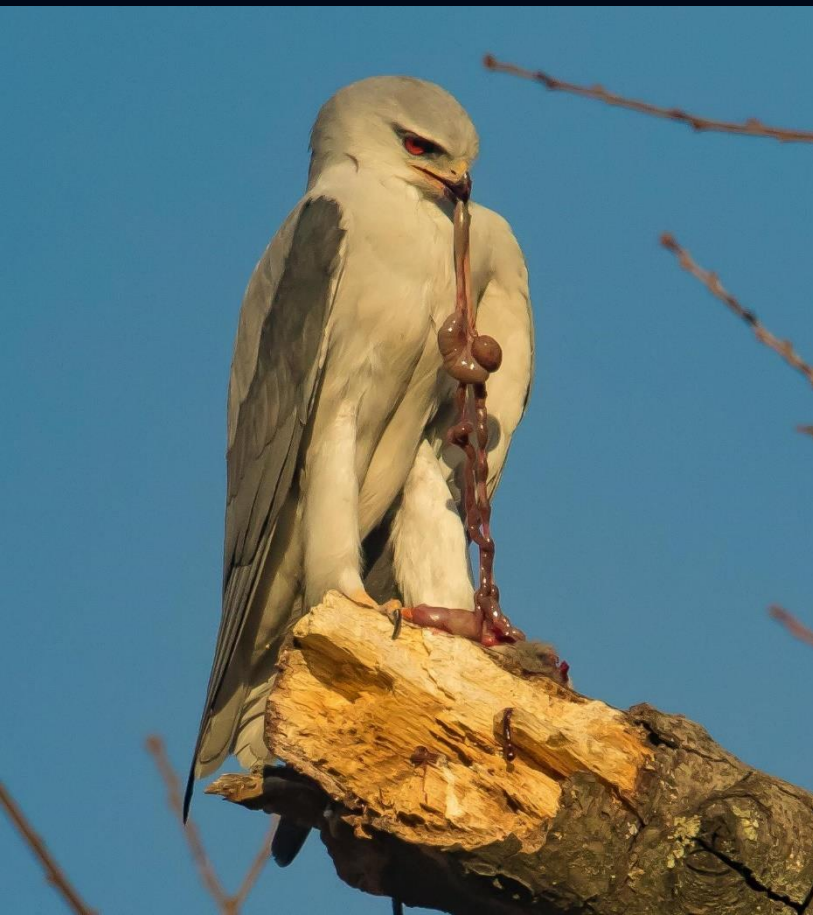
Bottom Left; Black Shoulder Kite | Bottom Right; Slender Mongoose