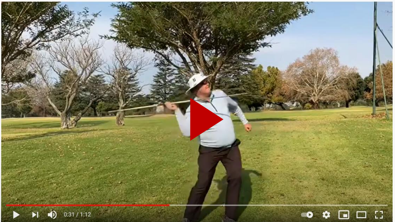
Your monthly golf tip - May 2021

Have a look at the video below on how the angles of the body for throwing an object such as a ball or a spear are similar as in an athletic golf swing.