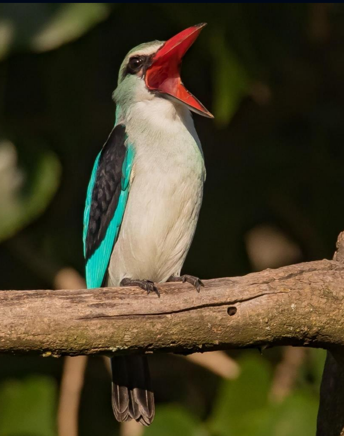
Bottom Left; Woodland Kingfisher | Bottom Right; Longcrested Eagle