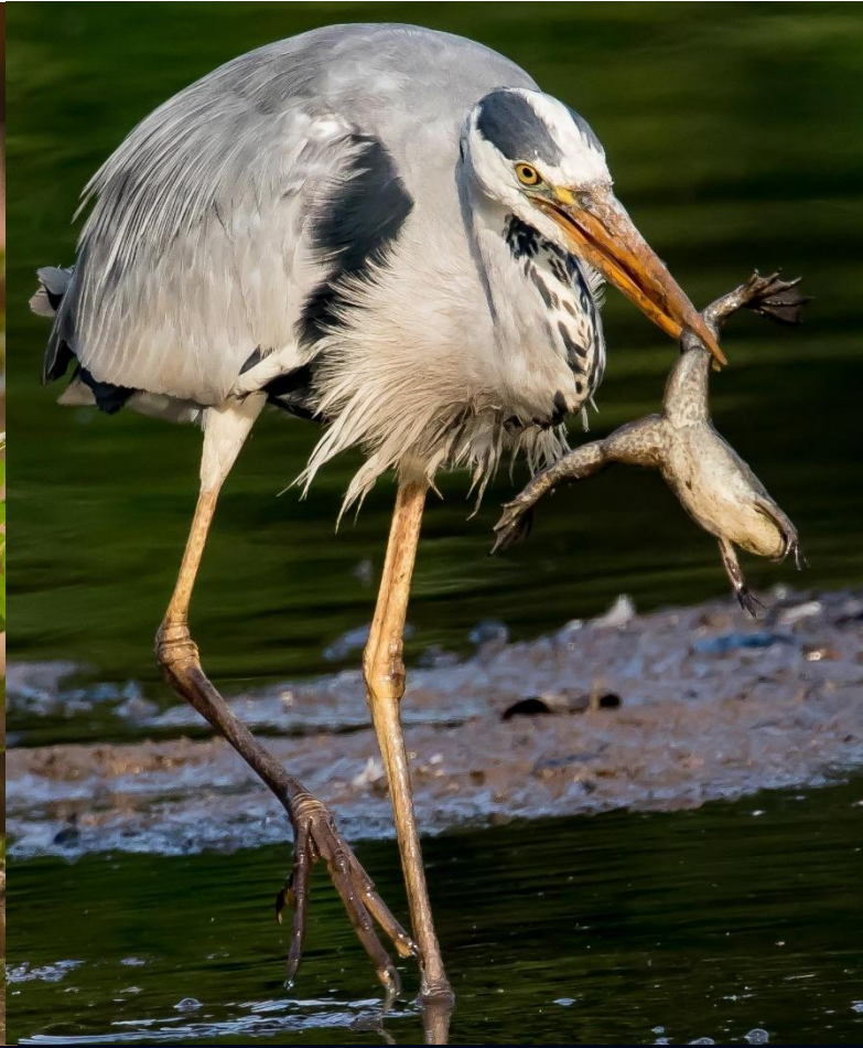
Top Left; Vereauxs Owl | Top Right; Grey Heron